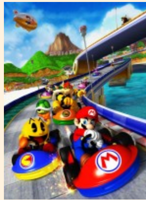
Mario Kart for Wii