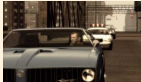
Grand Theft Auto IV