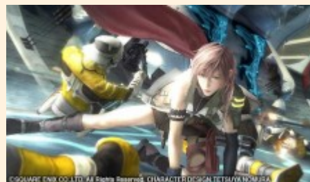
Final Fantasy XIII