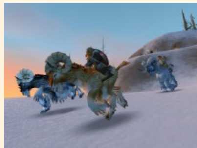
World of Warcraft

This newsletter is sponsored by Enough Is Enough (EIE), a non-partisan, 501(c)(3) non-profit organization, which emerged in 1994 as the national leader in online safety. Since then, EIE has pioneered and led the effort to confront online pornography, child pornography, child stalking and sexual predation with innovative initiatives and effective communications.